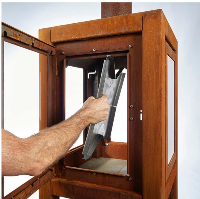
Put the heatshield sideways inside the fireplace.