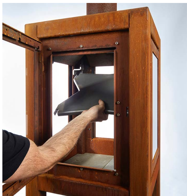
Turn it with the flat surface horizontal