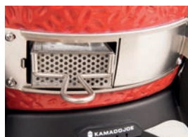
Patented Ash Collector