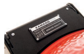
Air Lift Hinge