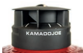
Kontrol Tower Top Vent