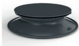
Patented Hyperbolic Insert