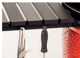
Aluminum Side Shelves