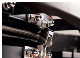
Stainless Steel Latch